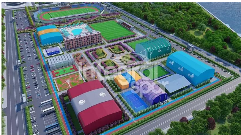
Fig. 2. Multifunctional sports complex.

At the same time, it should be noted completely new directions in the development of the urban development theme of the formation of multifunctional sports complexes. The first is related to the inclusion of a sports facility in the structure of polyfunctional public facilities (Fig. 2).